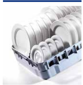
Rack systems 600 x 500 for large hooded and travelling rack dishwashers