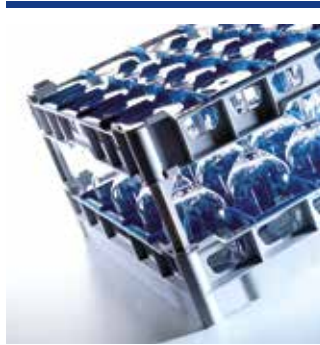
Rack systems 500 x 500 for the gastro field