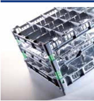
Rack systems 400 x 400 for smaller dishwashers in the under-counter area

Find out about the variety of our products.