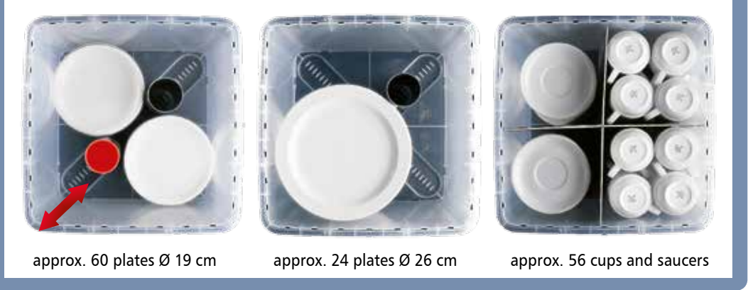
approx. 60 plates Ø 19 cm

Plates or even smaller items of crockery can be transported safely and easily using the Vary tool or appropriate dividers. The Vary tool is fixed by putting the lid on.