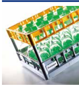
Rack systems 600 x 400 for the logistics and catering field