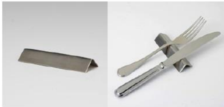
Flatware Rest DV.S.003.00.004