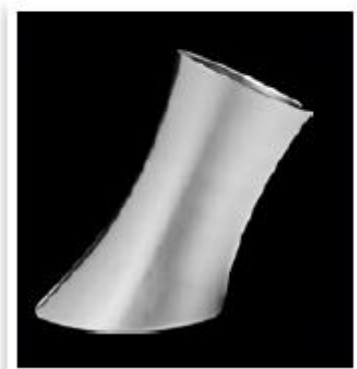
Slant Wine Bottle Cooler Double Body, Satin Finish 2.5.003.00.365 9"h