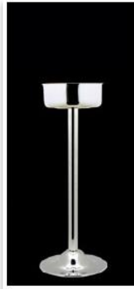
Round Stand 2.5.003.00.355 26"h