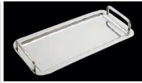
Tea Tray w/ Handle 2.5.003.00.702 11.5" x 5" (29x13cm)