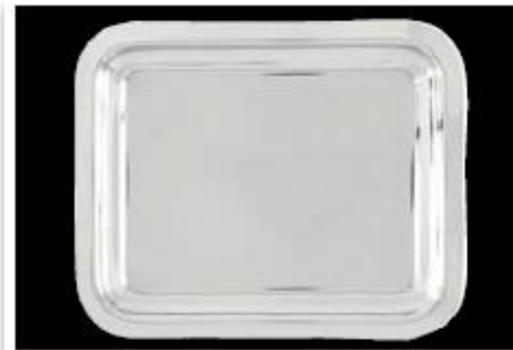
Rectangular Tray 2.5.003.00.750 11.25" x 9.25" (28.5x23cm)