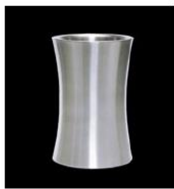
Glacette Double Body, Satin Finish 2.5.003.00.366 8"h