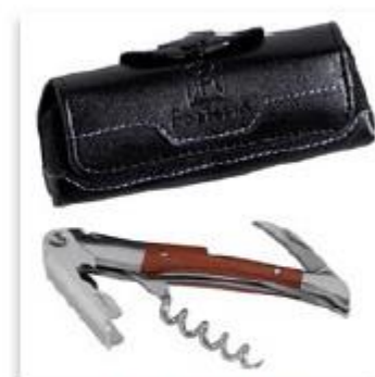
Sommelier's Bottle Opener w/ Leather Pouch 1.5.003.00.242