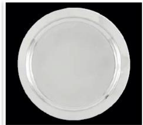
Round Tray 2.5.003.00.741 12.8" (32.5cm)