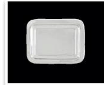
Rectangular Tray 2.5.003.00.730 8.25" x 6.5" (21x17cm)