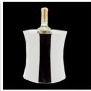
Silhouette Wine Cooler 2.5.003.00.326 7.25"w x 8"h