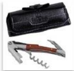
Sommelier Bottle Opener with Leather Pouch 1.5.003.00.242