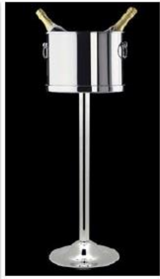
Oval Stand 2.5.003.00.352 26"h Wine/Champagne Oval, 2 bottle 2.5.003.00.360 9"h