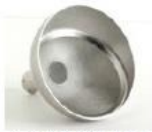
Aerating Wine Funnel with Screen 0019.111982F