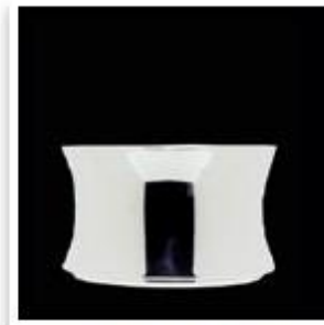
Silhouette Bottle Coaster 2.5.003.00.329 4.75"w x 2.75"h