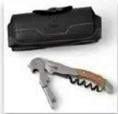
Double Step Bottle Opener with Leather Pouch 1.5.003.00.542