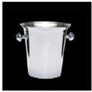
Wine bucket w/knobs 2.5.003.00.325 9"h x 8.5"w