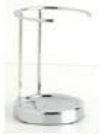
Stand Only for Aerating Wine Funnel 0019.111982STND