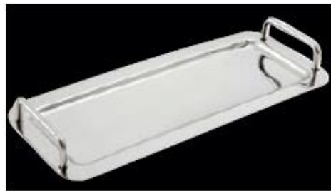
Rectangular Tray w/ Handle 2.5.003.00.752 12.5" x 6.25" (32x16cm)