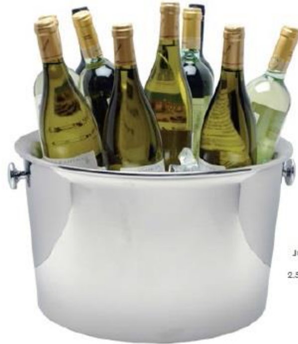
Jumbo Insulated Basin, 10 bottles 2.5.003.00.393 16.5" x 10"