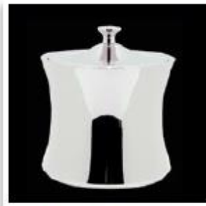
Silhouette Iced Bucket 2.5.003.00.328 7"w x 8"h