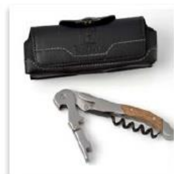
Double Step Bottle Opener w/ Leather Pouch 1.5.003.00.542