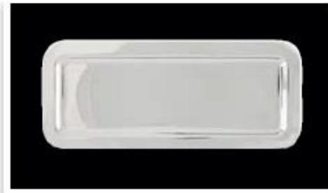
Tea Tray 2.5.003.00.701 11.5" x 5" (29x13cm)